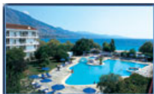
Main Building & Pool