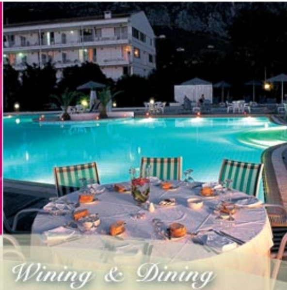
Wining & Dining